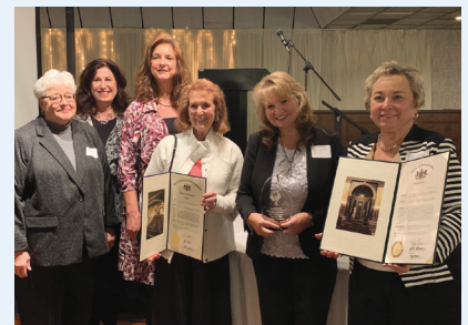
Credit union staff and board members accept Phoenix Award.

Over the past two years, the Credit Union completed a $1 million renovation project, updated computer systems, expanded electronic services, completed a core system upgrade, and expanded from one county, to now serving seven counties in Pennsylvania and Ohio – all done to better serve the community well into the future.