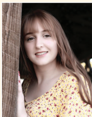
Lauren Bonner Reynolds Jr./Sr. High School