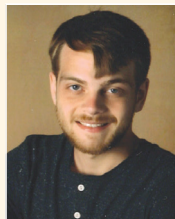
Dylan Evans Reynolds Jr./Sr. High School