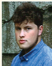
Ellis Law Hickory High School