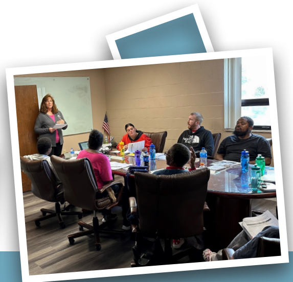
FINANCIAL LITERACY CLASS AT PRINCE OF PEACE