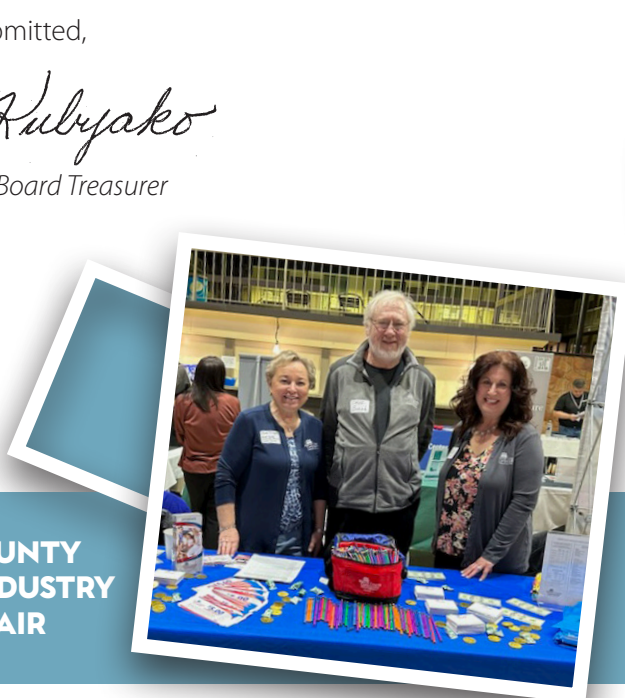
MERCER COUNTY BUSINESS & INDUSTRY CAREER FAIR