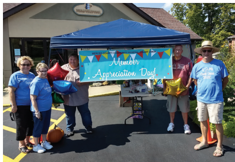
LEFT: Our Board Members and Supervisory Committee at Member Appreciation Day